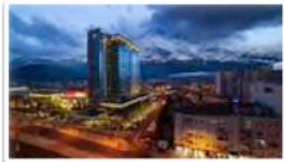
Radisson Blu Hotel, Kayseri