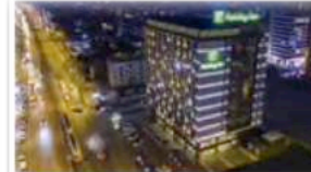
Holiday Inn Kayseri - Duvenonu